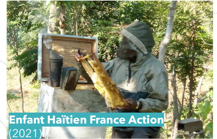
Enfant Haïtien France Action (2021)