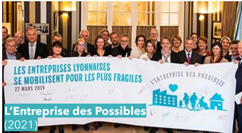
L'Entreprise des Possibles (2021)