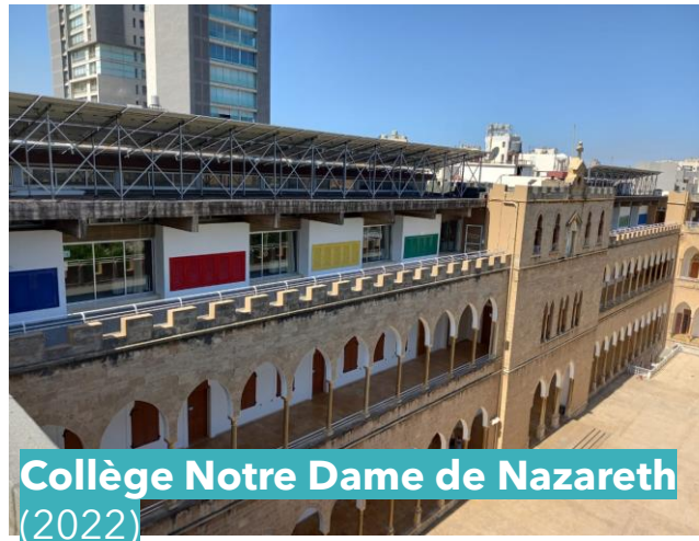
Collège Notre Dame de Nazareth (2022)