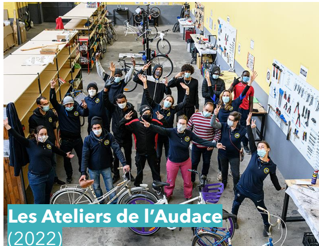
Les Ateliers de l'Audace (2022)