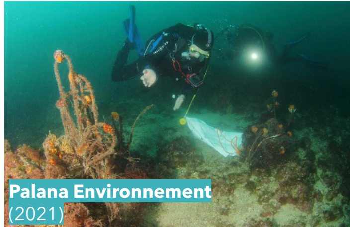
Palana Environnement (2021)