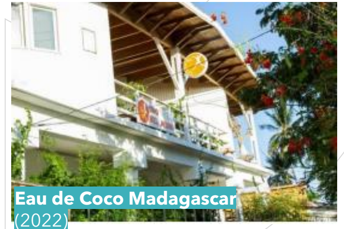
Eau de Coco Madagascar (2022)